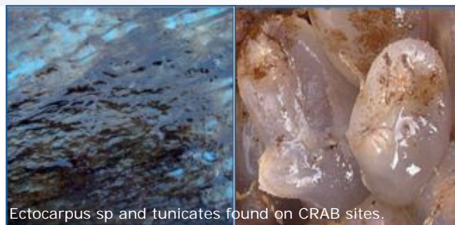
Ectocarpus sp and tunicates found on CRAB sites.

Ascidians were found from April in southern sites and from summer (and into winter in the British Isles).